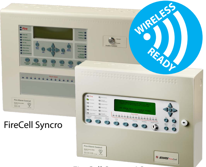
FireCell Syncro AS

To deliver best in class performance as well as an unrivalled user experience EMS continually collaborate with FireCell partners, Kentec and Apollo, to bring innovation and added functionality to the FireCell wireless fire detection system.